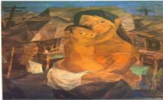
MADONNA IN THE SLUMS

VICENTE MANANSALA (January 22, 1910 – August 22, 1981) was a Filipino cubist painter and illustrator. Manansala's paintings are the best and were celebrated as the best of the barrio and the city together. His Madonna of the Slums is a portrayal of a mother and child from the countryside who became urban shanty residents once in the city. In his Jeepneys , Manansala combined the elements of provincial folk culture with the congestion issues of the city.