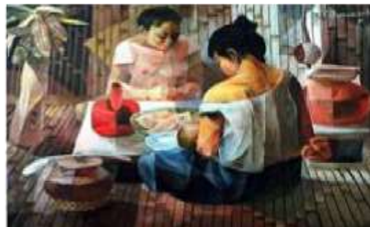
GIVE US THIS DAY OUR DAILY BREAD

https://en.wikipedia.org/wiki/Vicente_Manansala